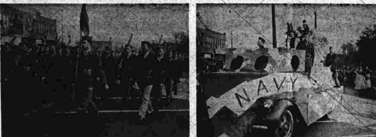
A battery of troops representing the U. S. Army units stationed here rounding the Center at the start of the parade last night. The local army troops, mounted and dismounted, presented a fine appearance.